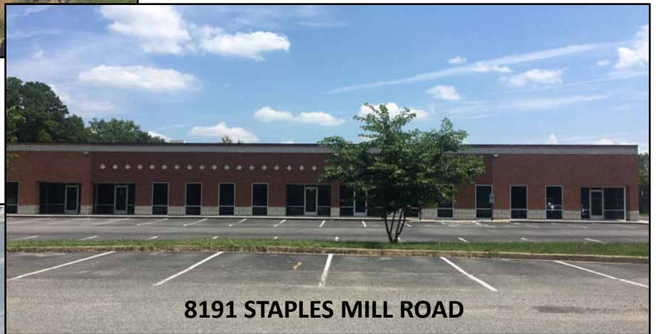
8191 STAPLES MILL ROAD

Located just behind Wistar Center, on Staples Mill Road in-between Glenside Drive and Parham Road.